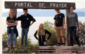
Music & Worship