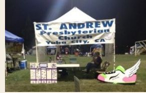
Serving Our Community