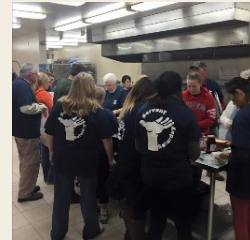
Fellowship & Serving Together